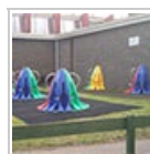
Other cycling parking spaces 18 spaces