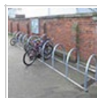
Cycle racks 0 cycle parking spaces