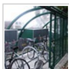
Helmet lockers 0 lockers