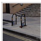
Sheffield stand 0 cycle parking spaces