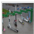
Scooter parking spaces 0 spaces