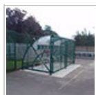
Covered sheffield stand 0 cycle parking spaces